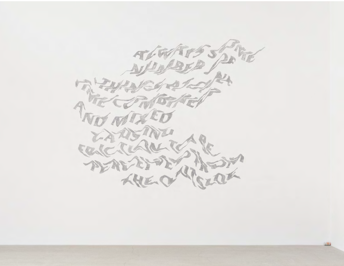
Above, and cover detail: Always Some Number of Things , 2021. Beer can on wall, 118 x 148 in. (300 x 376 cm)

This tension is also given form, by way of literal friction, in a large-scale drawing executed on-site, in which Boisjoly has rubbed an unopened beer can on the wall's surface to render rippled, undulating text. Boisjoly's choice of beer can as a medium refers to a range of cultural associations ("Always some number of things," read a recent beer-can work). The beer can's graphite-like quality calls to mind silverpoint drawing, with its own art-historical references concerning image production, while the object itself, wielded by the artist, openly brandishes a harmful stereotype—one that negatively associates alcohol with people of Indigenous heritage. The artist's recent exhibition text put it plainly: "Using a container for alcohol as a drawing implement for a barely legible English text is not a neutral gesture." 6