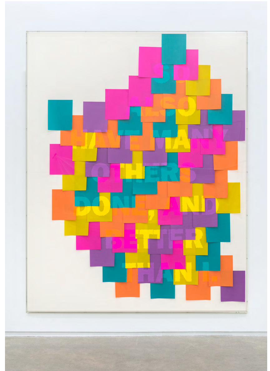
As It Comes (so also) , 2013. Inkjet prints, staples, 90 x 70 in. (229 x 178 cm).