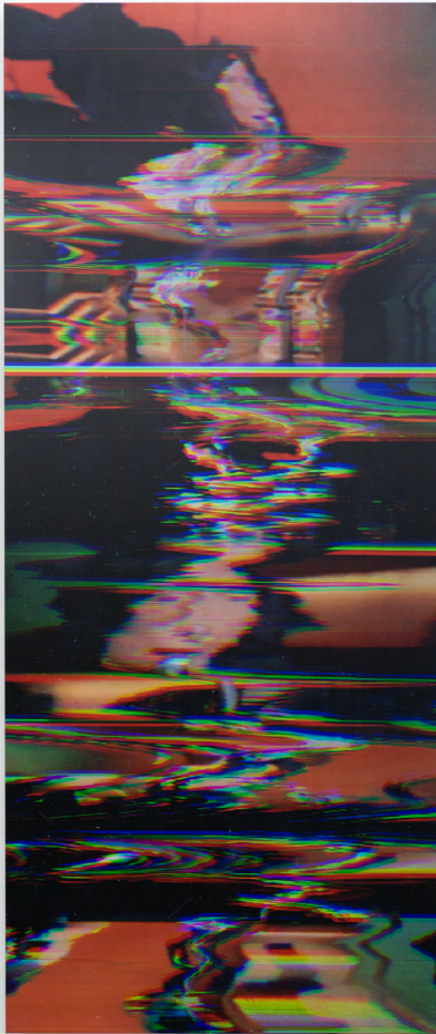
Buffy Sainte-Marie (Illumination: 1969/2013) Keeper of the Fire 01 , 2013. Screen resolution lightjet print mounted on dibond, 96 x 40 in. (244 x 102 cm).

he engages. For example, to make Intervals (2013), a series of large-scale digital C-prints, Boisjoly played YouTube versions of televised musical performances by sixties- and seventies-era performers, like Pat and Lolly Vegas and Buffy Sainte-Marie, on an iPad and then captured the screen on a flatbed scanner. One would be mistaken to read these works simply as a rumination on the layers of technological mediation, or lost fidelity to an original. Rather, Boisjoly lays bare the murky processes by which performance, personae, and media give shape to (and distort) personal and cultural identity, as well as ideas of "tradition." Irregular and improvised evolutions of digital translation—compression, lossiness, artifacting—also offer visual metaphors for cultural transmission and show us productive possibilities. As uncertainties are introduced and embedded, and an original (and its presumed authenticity)