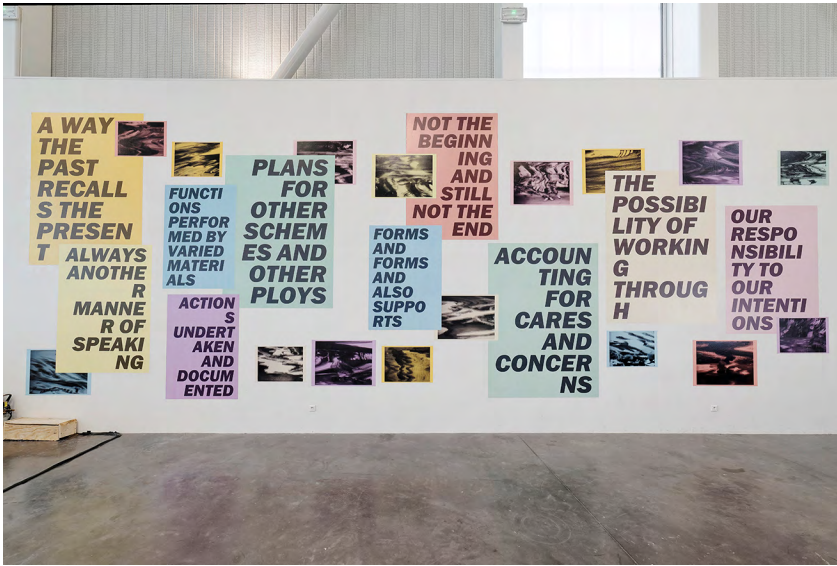
Author's Preface , 2015. Twenty-five solvent-based inkjet prints, premixed wallpaper paste, 136 x 361 in. (346 x 917 cm) overall. Installation view: Moucharabieh , Triangle France, Marseilles, France, 2015.

Syncopated with abstracted images (again moving images subjected to a process of scanning and distortion), these partial phrases appear to emerge and recede across the wall, like the visualized speech of an overheard conversation.