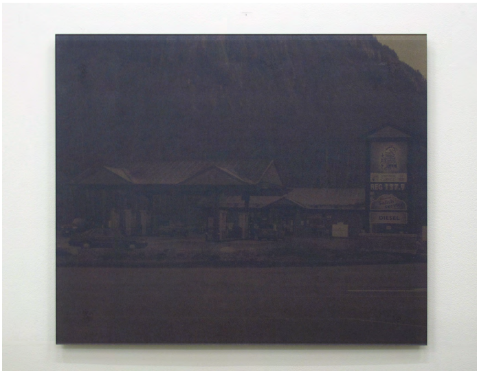
Rez Gas (9001 Valley Dr, Squamish, BC, VoN 1To), 2013. Sunlight, construction paper, acrylic glass, 30 x 35 in. (75 x 89 cm).

In As It Comes (2013), as well as several other works, brightly colored sheets of office paper overlap in large-scale clusters, upon which text is printed and becomes legible from a distance. As artist Kevin Rodgers has observed, "The phrases never clarify [but] are always receding, as if in awareness of their own irredeemable incompleteness." 2 Similarly, in Author's Preface (2015), inkjet prints pasted to the wall read as syllabic bursts of thoughts that remain incomplete, and the final letter or two of words cut by the margins drop to the line below. These sentences have both a philosophical air while touching on the technical and forensic: "Not the beginning and still not the end," reads one; "Actions undertaken and documented," offers another.