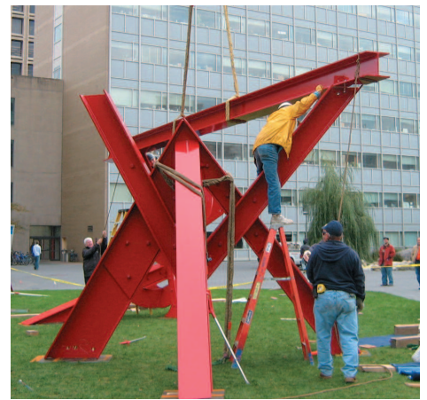
Artist Mark di Suvero and crew during the installation of Aesop's Fables, II on the MIT campus, October 27, 2005.

“That certain size I often use is the radiative core of the piece,” he continued, “and then it extends from there. The smaller pieces have different kinds of compression. I often use immense scale in very small pieces, while the larger pieces can sometimes seem surprisingly comfortable, even though they might be fifty feet tall.”