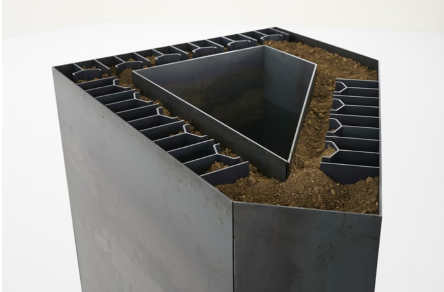
New Generation, Detail, 2022 (detail). Black steel, soil, 59 × 29½ × 39¾ in. (150 × 75 × 100 cm).