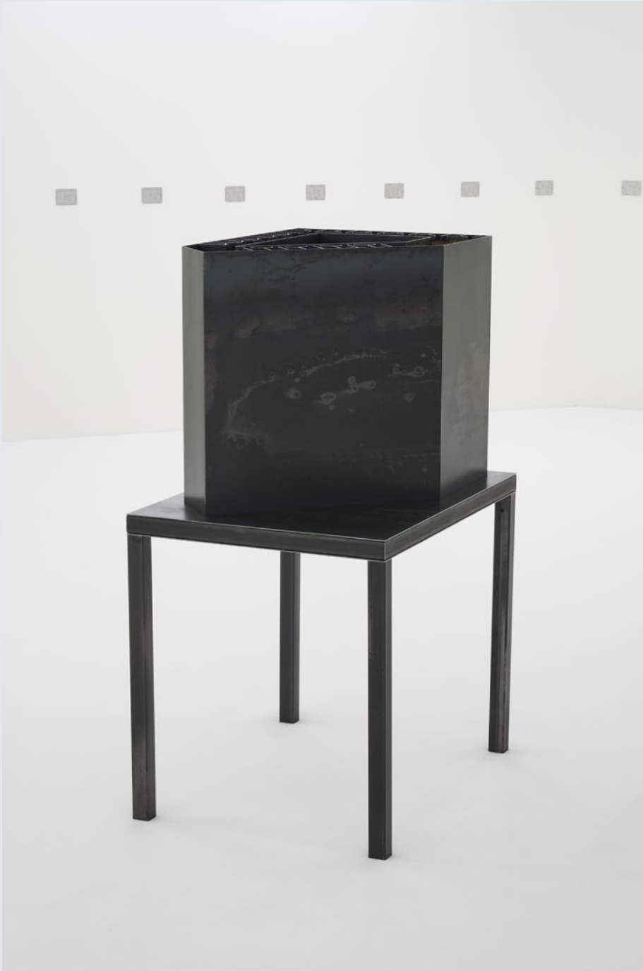
Above: Installation view: Civic Floor , Mudam, Luxembourg, 2022.

With this suite of works, as well as in a new multichannel sound installation compelling visitors to traverse the gallery, Tieu invites us to consider space and its allowances in not only formal, sculptural terms that entreat the histories of Minimalism but also sociopolitical terms, which echo the title's invocation of citizenship and the rights it confers.