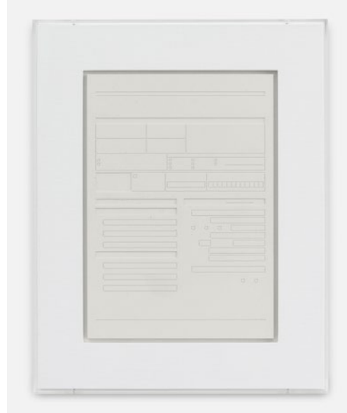
Grid, Form I-602, 2022 (detail). Plaster, framed in linen on wood and Perspex, twelve parts: 16½ × 13¾ × 1¼ in. (41.9 × 33.38 × 3.17 cm) each.