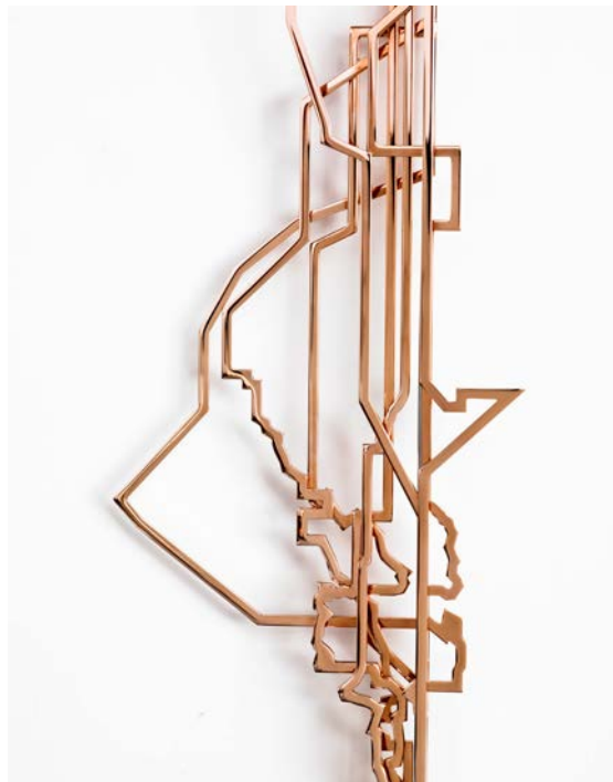
Alle Zeit der Welt [All the Time in the World], 2015. Copper, stainless steel, three parts: 78¾ × 9½ × 1¼ in.; 78¾ × 7⅞ × 1¼ in.; 78¾ × 12½ × 2½ in. (200 × 24 × 4.5 cm; 200 × 20 × 4.5 cm; 200 × 32 × 6.6 cm). Courtesy the artist and König Galerie, Berlin/London. Photo: Roman März

Yet, by erecting a clock in a public space such as a park 5 or university campus, Kwade homes in more specifically on time's political relationship to productivity, labor, and value, not unlike Franklin's age-old truisms. If time indeed is money , the clock is what facilitates it, as it has done since its popularization began in the fourteenth century. Public clocks were erected on town squares and in church towers in the market towns of medieval Europe and helped to restructure civic and religious life by centralizing and synchronizing time. This specifically entailed a standardizing of labor time, now measured in hours and minutes, where it had earlier been predominately task-oriented—that is, structured around specific chores in the fields or the home. Historian E. P. Thompson recounts how time-keeping embodies a simple relationship in