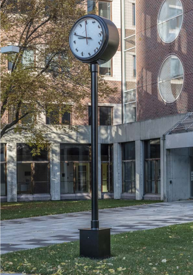
Against the Run , 2019. Previously installed at temporary site: MIT Medical (Building E23). MIT Collection commissioned with MIT Percent-for-Art funds.

early capitalist production: those who are employed experience a distinction between their employer's time and their "own" time. And when the value of time is reduced to money more than anything else, employees must use the time of their labor and not see it wasted. "Time," Thompson asserts, "is now currency: it is not passed but spent." 6