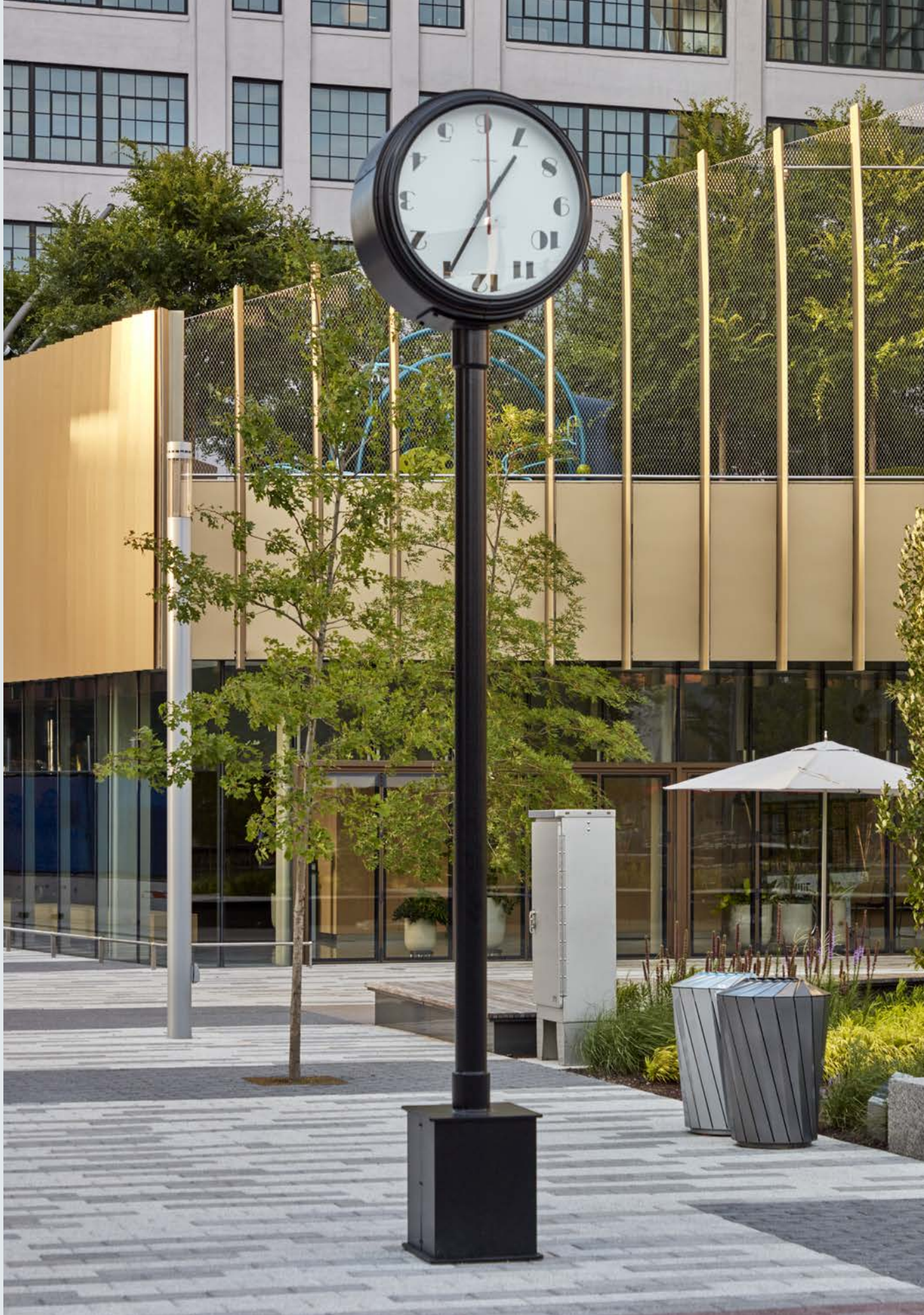
Against the Run , 2019. MIT Collection commissioned with MIT Percent-for-Art funds.