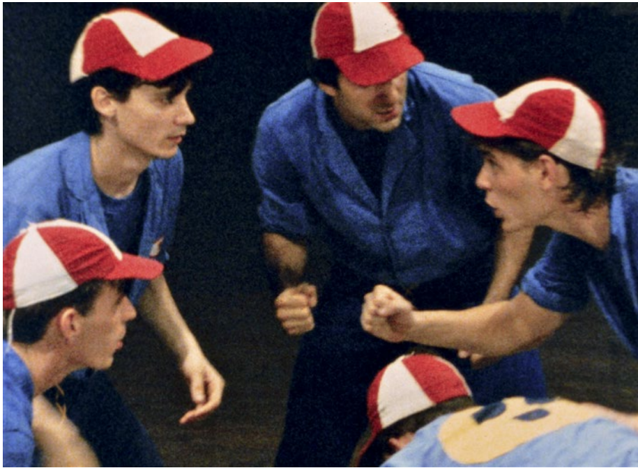
Still from You the Better