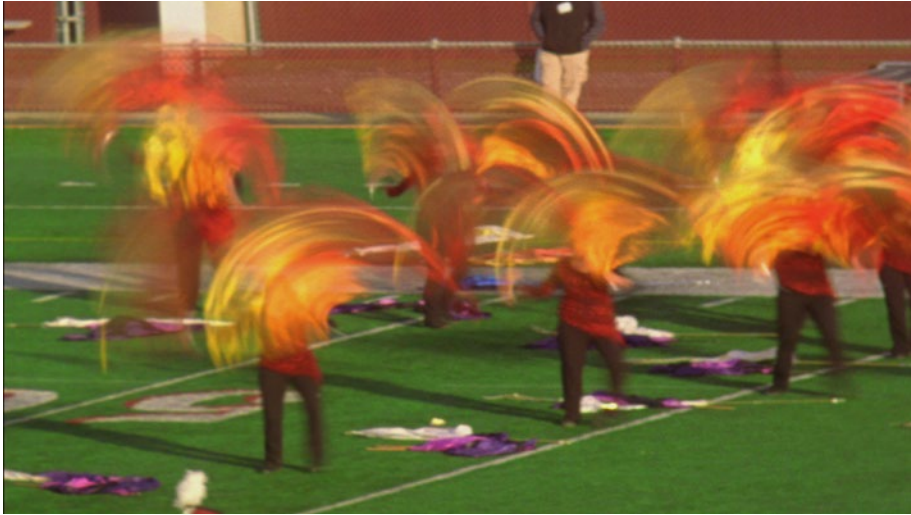
Still from Tension Building

Minuteman Marching Band—heightens the frenzied cinematography, creating a sensation of perpetual motion. This axial rotation is punctuated by abrupt collisions with the stadium's concrete dividers and crosscuts with footage of the cheer squads, color guard, and UMass football players on the field, warming up and in action. Competitors and field entertainers crescendo to on-screen blurs, while the stadium itself pulsates wildly, an effect that draws together the architecture with the excesses of embodied labor involved in sports events and competition.