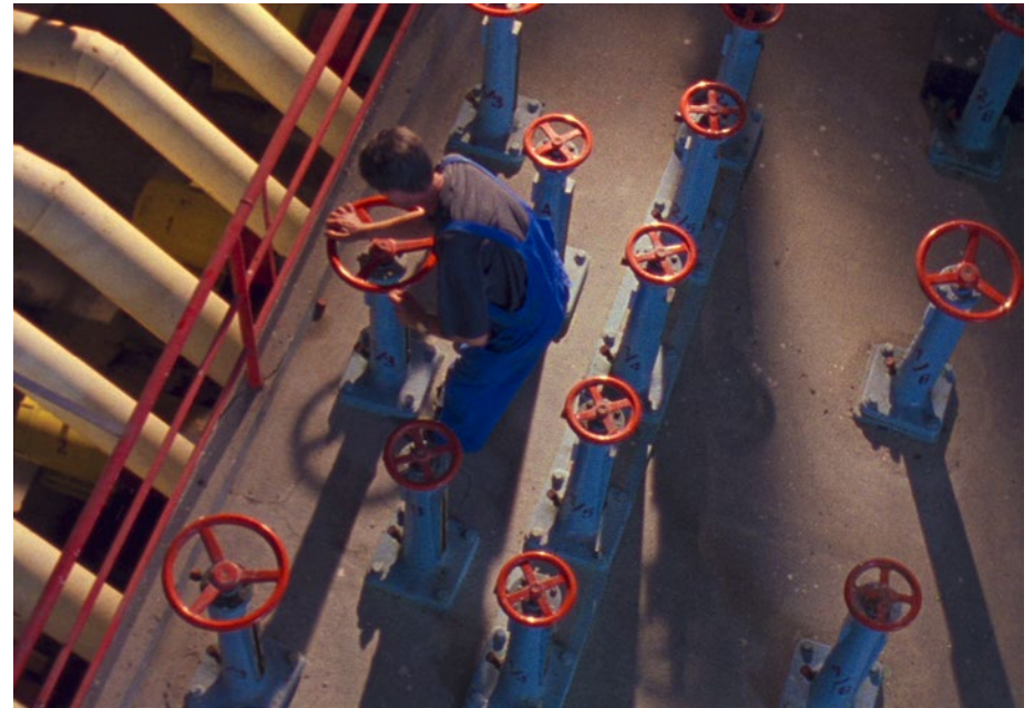
Still from Switch Center